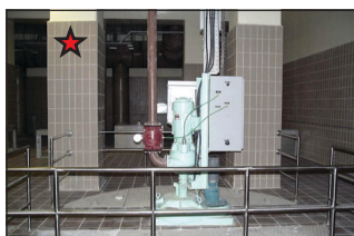
Um Al Hyman, Kuwait