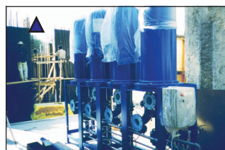
Wadi Sir, Jordan