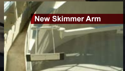
New Skimmer Arm

Customer's have found that when they use Smith & Loveless' construction management team for site supervision of the retrofit using a local contractor, the customer saves time and money because S&L knows how the equipment goes together and how it works - that's our business.