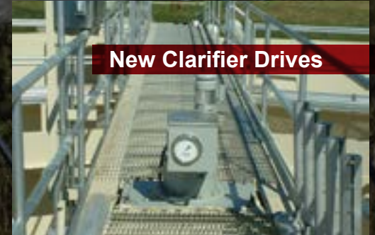
New Clarifier Drives