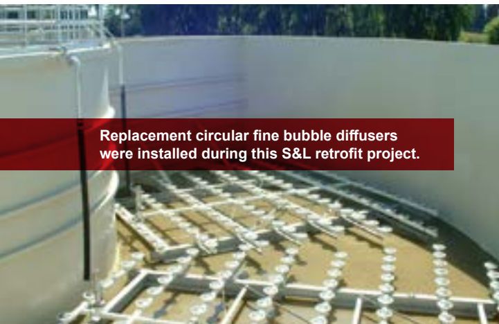
Replacement circular fine bubble diffusers were installed during this S&L retrofit project.

Outside of some mixing applications, aeration efficiencies greatly improve by upgrading from coarse bubble to fine bubble diffusers. No matter what type of diffuser or WWTP, Smith & Loveless Retrofit can provide you with the best type of fine bubble diffuser for your specific application. Call today!