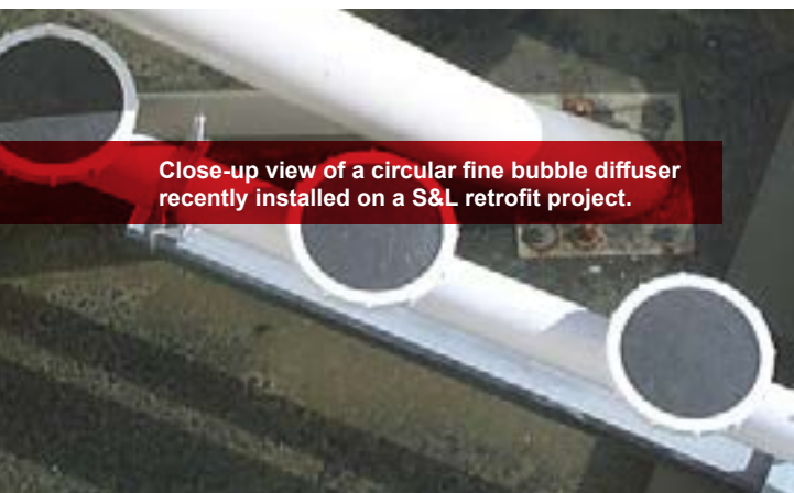
Close-up view of a circular fine bubble diffuser recently installed on a S&L retrofit project.