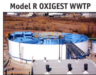
Auto Manufacturer Chihuahua, Mexico