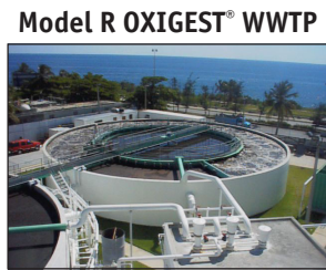
Brewery/Beverage Processor Santo Domingo, D.R.