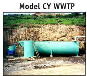
Residential Plymouth, Montserrat

Online: smithandloveless.com • Phone: 913.888.5201 • FAX: 913.888.2173